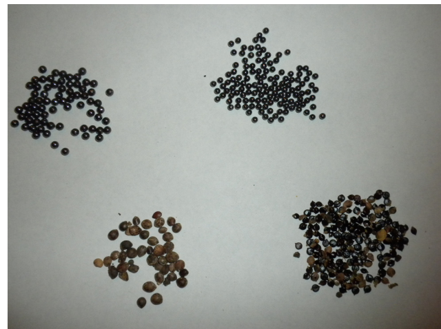
Figure 1. Popular shot sizes for bird hunting is similar in size to many preferred game bird foods. Clockwise from top left, #6 lead shot, #8 lead shot, woolly croton seed and Pennsylvania smartweed seed.

Upland game birds also are susceptible to lead poisoning. Lead impacts have been documented for virtually every species of upland game bird in the U.S., including ring-necked pheasant, northern bobwhite and wild turkey, but perhaps no other upland game bird is more at risk than the mourning dove. The primary reason for their susceptibility is the same as waterfowl's--concentrated hunting. Some dove fields collect more than 2.5 million pellets per acre each year. Since the ground is often bare or nearly so in prepared fields, lead is more available for ingestion. Also, the size shot commonly used for dove hunting is very similar to seeds consumed by the